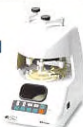
LS-82 Lens Marker/ Blocker