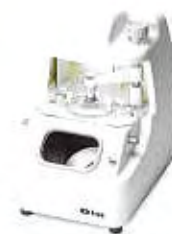
LS-3E Lens Blocker