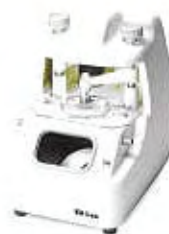
LS-3W Lens Marker/ Blocker